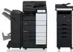
Multifunction Printing Systems