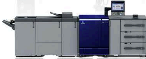
Color / Black & White Production Printing