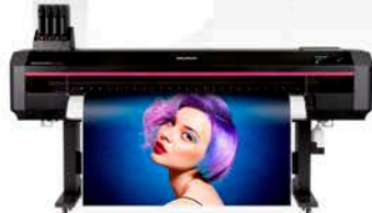
Wide Format Print Systems